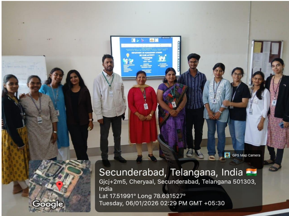
Secunderabad, Telangana, India 🇮🇳 Gcj+2m5, Cheryaal, Secunderabad, Telangana 501303, India Lat 17.51991° Long 78.631527° Tuesday, 06/01/2026 02:29 PM GMT +05:30