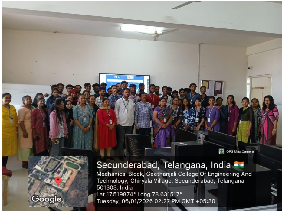
Secunderabad, Telangana, India 🇮🇳 Mechanical Block, Geethanjali College Of Engineering And Technology, Chiryala Village, Secunderabad, Telangana 501303, India Lat 17.519874° Long 78.631517° Tuesday, 06/01/2026 02:27 PM GMT +05:30